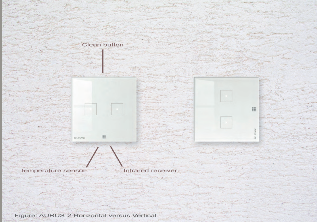
Figure: AURUS-2 Horizontal versus Vertical